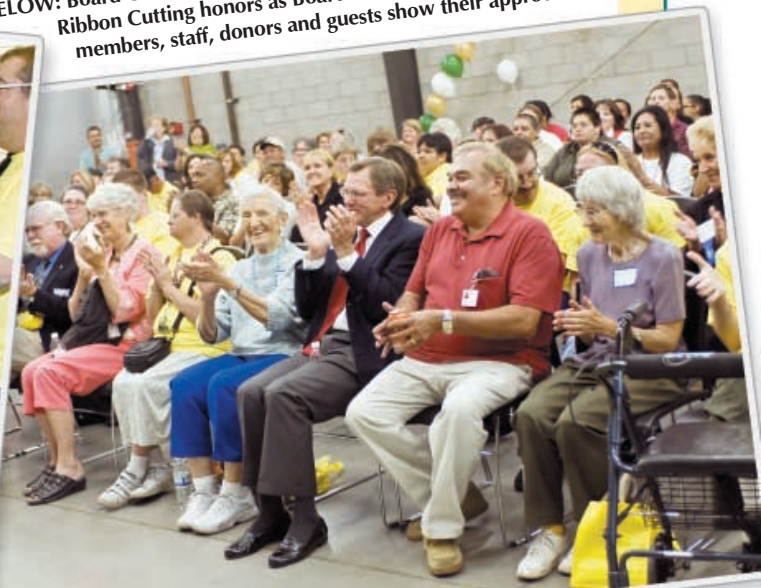
PHOTO FEATURE CONTINUES ON CENTER SPREAD