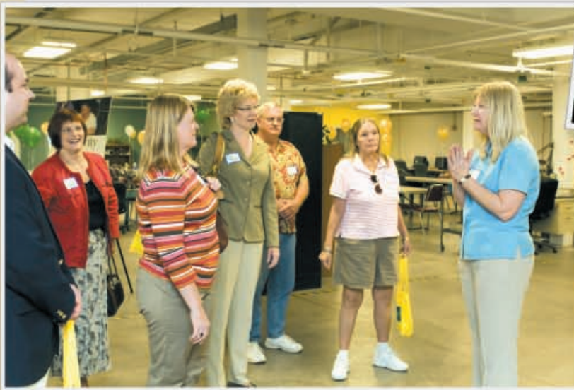
Open House guests enjoyed tours conducted by senior staff...