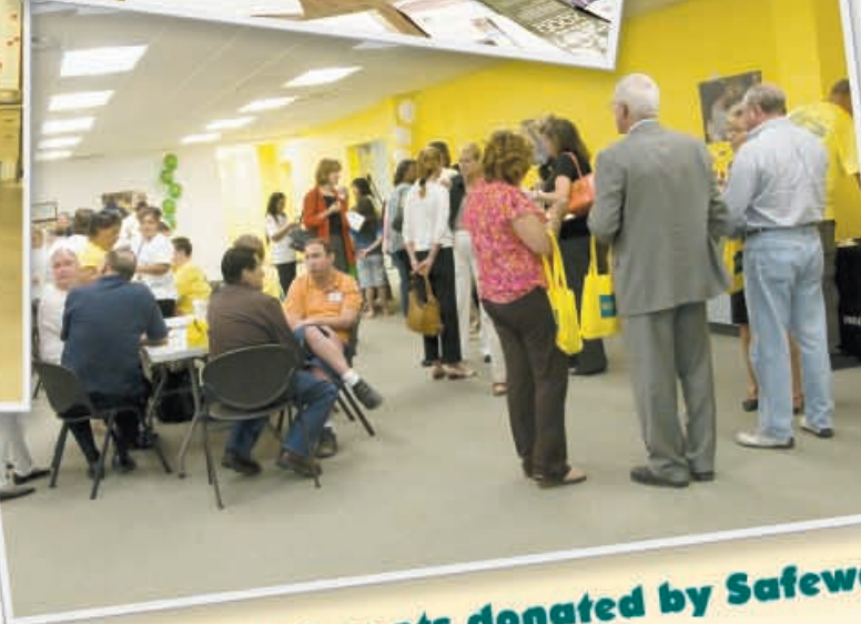
...and refreshments donated by Safeway