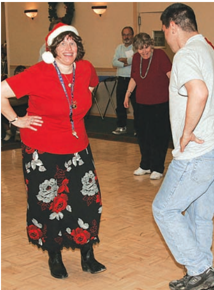
Beacon clients, staff, parents, board members and friends dance at the holiday party hosted by Beacon in December.

I n December, Beacon hosted approximately 600 clients, staff, parents, board members and friends for its annual holiday party at the Inn Suites hotel. In addition to the great food and dancing, Beacon also presented its annual Awards for Excellence.