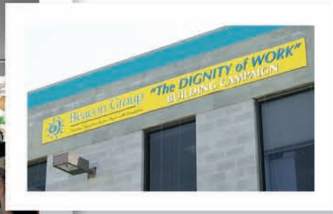
Beacon proudly displays its "Dignity of Work" Building Campaign banner on its headquarters building in Tucson.