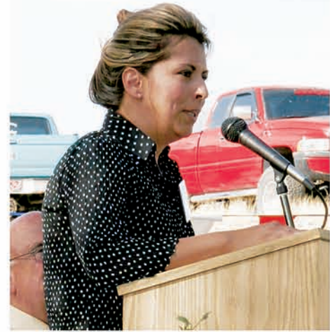
Right: Arizona State Sen. Charlene Pesquiera speaks during the groundbreaking ceremony.