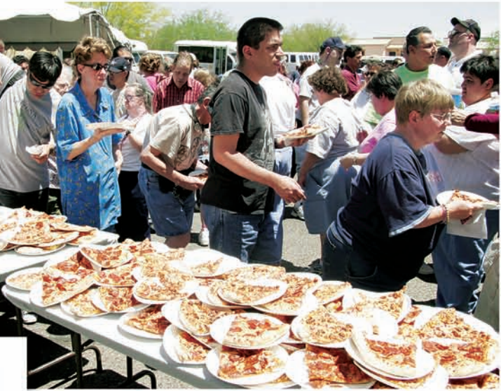
Beacon clients and staff enjoy pizza during the groundbreaking ceremony.