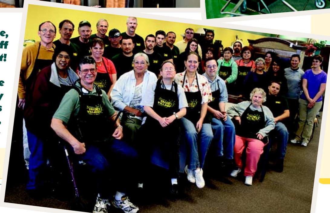
Value Village employs many Beacon clients in the retail, warehouse and laundering operations