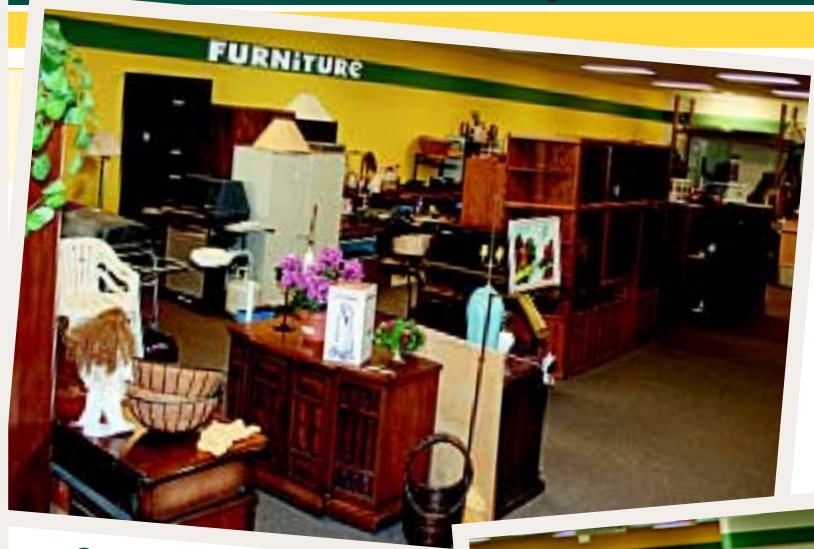
...Collectibles, Fitness Items, and Home & Office Furnishings