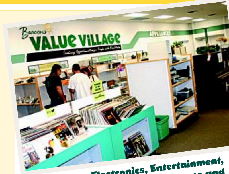
Electronics, Entertainment, Home Appliances and Accessories...