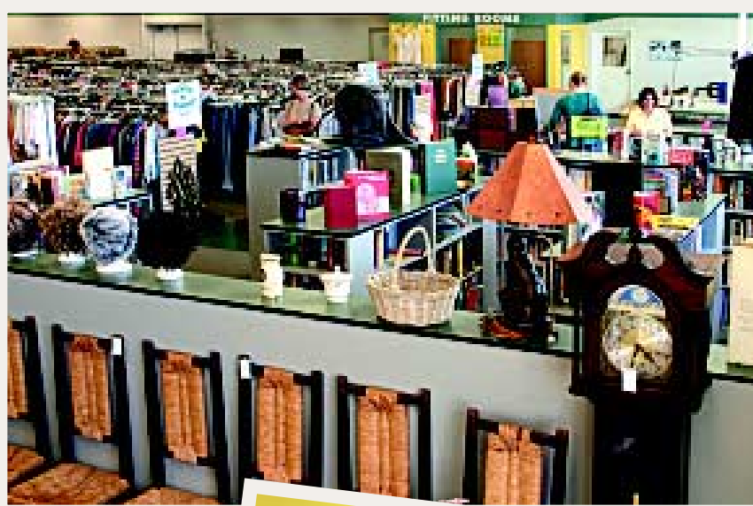
...Books, Magazines, Toys, Music, Software, and a huge selection of "Clean&Fresh" clothing for Men, Women, and Children